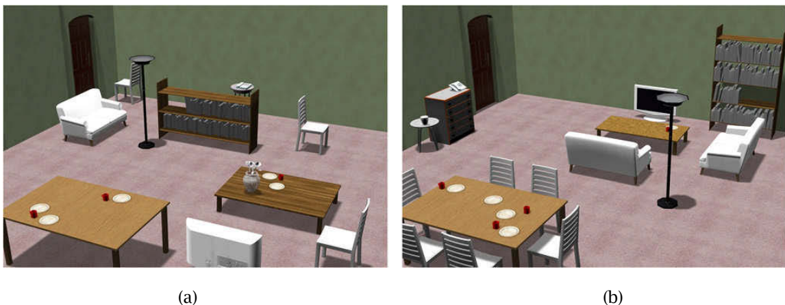
Fig. 3: A procedurally generated living room: (a) without and (b) with some essential class relationships.

By procedurally adding objects to a layout with this solver, complete virtual worlds can be created automatically. The procedure defines which objects need to be placed in a particular scene and in which order. These objects are step by step added to the solver, which in turn generates a new valid layout. In these procedures, semantic attributes can be used to create specific results. For example, the procedure can contain an instruction to keep adding cabinets to the kitchen until the sum of the storage volume attributes of the placed cabinets exceeds a certain value. In Fig. 3, we show a living room scene generated twice with the same procedure, with and without taking into account some essential object class relationships, thus exemplifying the importance of these relationships in creating realistic scenes.